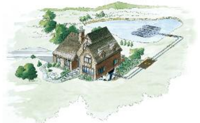
Pond Loops: Coils of pipe are fabricated and sunk to the bottom of the pond.