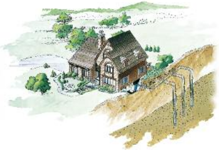
Vertical Loops: Used where land area is limited or soil conditions prohibit horizontal loops. Installed using a drilling rig.