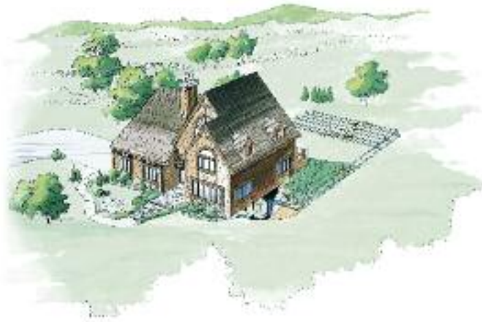
Horizontal Loops: Used on larger lots. Installed using a backhoe or trencher.

Geothermal systems can be installed with a variety of loop system configurations. “Closed loops” use re-circulated fluid in a series of pipes installed vertically, horizontally, or in a pond. “Open loops” use well water. Your dealer will determine which design works best for your home.