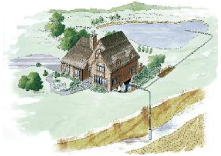
Open Loop: Well water from an existing well can be used, then discharged into a drainage ditch or pond.